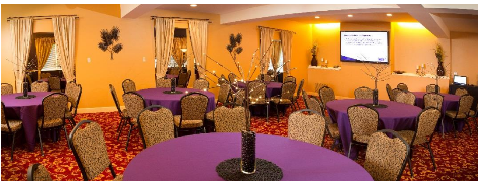
Alpha Room set up with banquet rounds