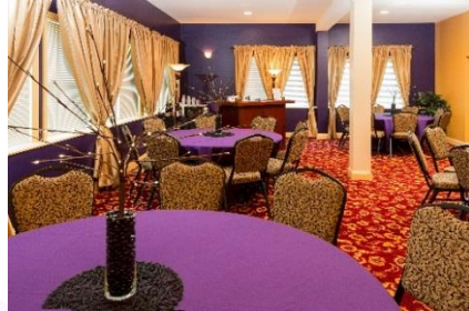
Beta Room set up with banquet rounds