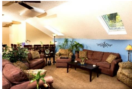
VIP Lounge (upper level)