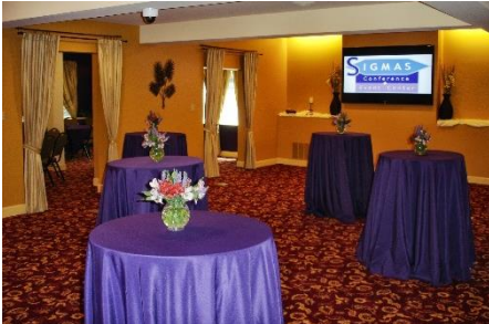
Alpha Room set up with cocktail tables