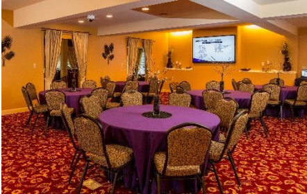
Alpha Room set up with banquet rounds