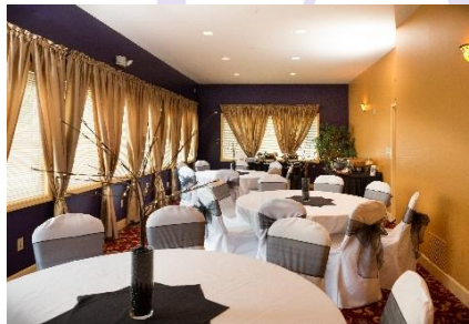
Chi Room set up with banquet rounds