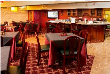
VIP Dining/Bar Room with bar (lower level)